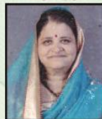
Sau LG Sarda