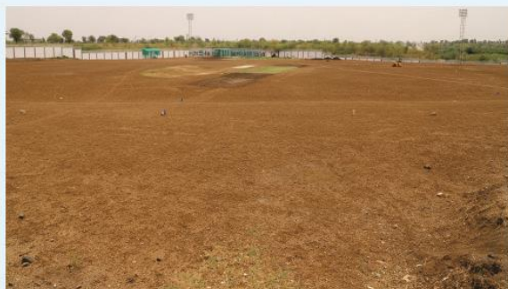
Aerial View of the Play Ground