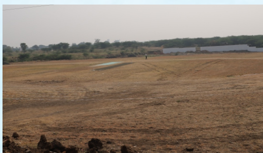
Aerial View of the Play Ground