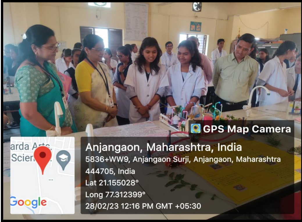
Students demonstrated project in front of guest in Science Exhibition