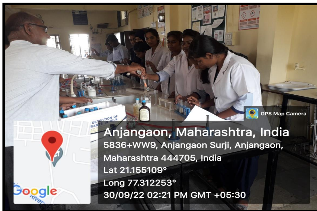
Detection of Adulterants by Milk Analysis conducted by B.Sc III Sem V students