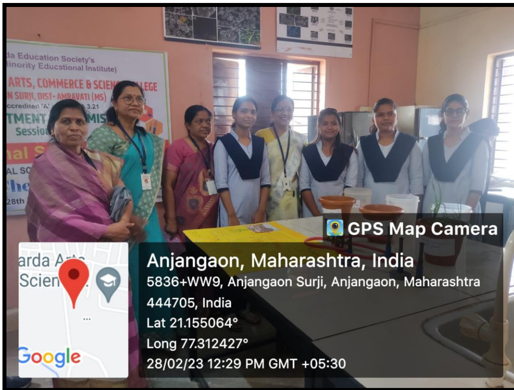
Science Exhibition-Chemfest conducted on National Science Day2023