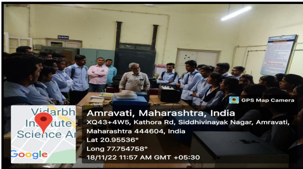
Demonstration of Advance IR Instrument by faculty member at GVISH Amravati