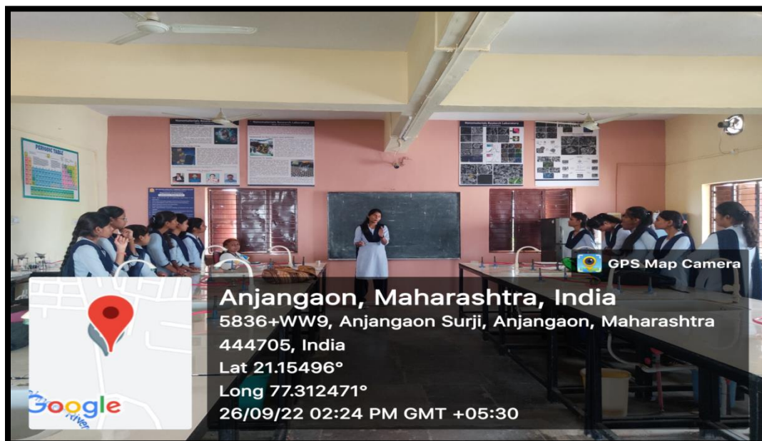
B.Sc II Sem III Student deliver Seminar on gravimetric Analysis