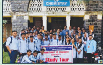
स्टडी टुर चे माध्यमातुन प्रत्यक्ष स्थळ भेट व अनुभव शिक्षण