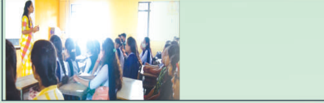
आयसीटी क्लासरूम (स्मार्ट क्लासरूमचे सहाय्याने अत्याधुनिक शिक्षण)