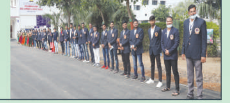
विद्यार्थ्यांच्या कलागुणांना वाव देण्याकरीता युथफेस्टीवल व स्नेहसम्मेलनाचे आयोजन