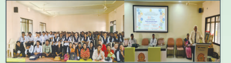
बॉटनिकल गार्डनचे माध्यमातुन विविध औषधी वनस्पतीचे वाटप व वनस्पती संगोपन प्रशिक्षण