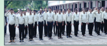
उच्च विद्याविभूषित, अनुभवी व तज्ञ शिक्षक वर्ग

वर्ग अकरावी ते पीएचडी पर्यंतचे शिक्षण देणारे शैक्षणिक हब