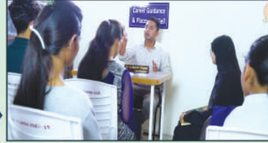
स्पर्धा परिक्षांचे निःशुल्क मार्गदर्शन प्रशिक्षण वर्ग व कॅम्पस प्लेसमेंट चे आयोजन