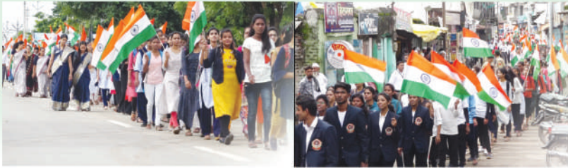
दि.१३ ऑगस्ट २०२२ रोजी आझादी का अमृत महोत्सव अंतर्गत रॅलीचे आयोजन