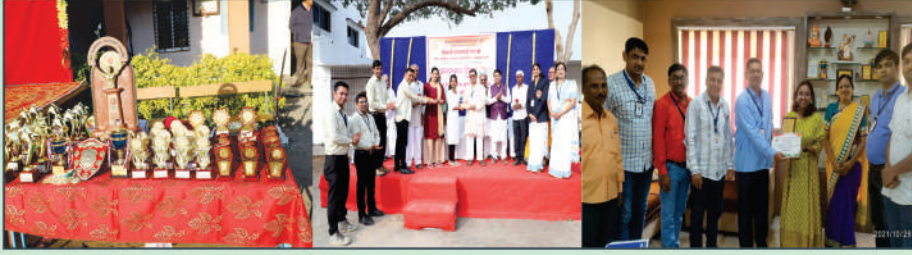
गणराज्य दिनी गुणवंत विद्यार्थ्यांचा सत्कार

महाविद्यालयात १५ ऑगस्ट २०२२ रोजी आझादी का अमृत महोत्सव कार्यक्रमांतर्गत माजी सैनिकांचा सन्मानचिन्ह, शाल व श्रीफळदेवुन सत्कार