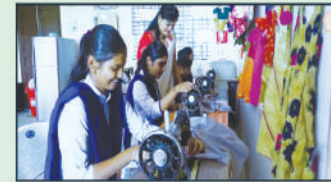
रोजगार व कौशल्य विकासावर आधारित विविध उपक्रम