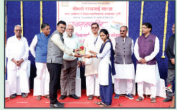
मोडीलिपी प्रशिक्षण वर्ग यशस्वीरित्या पुर्ण केल्याबाबत सत्कार